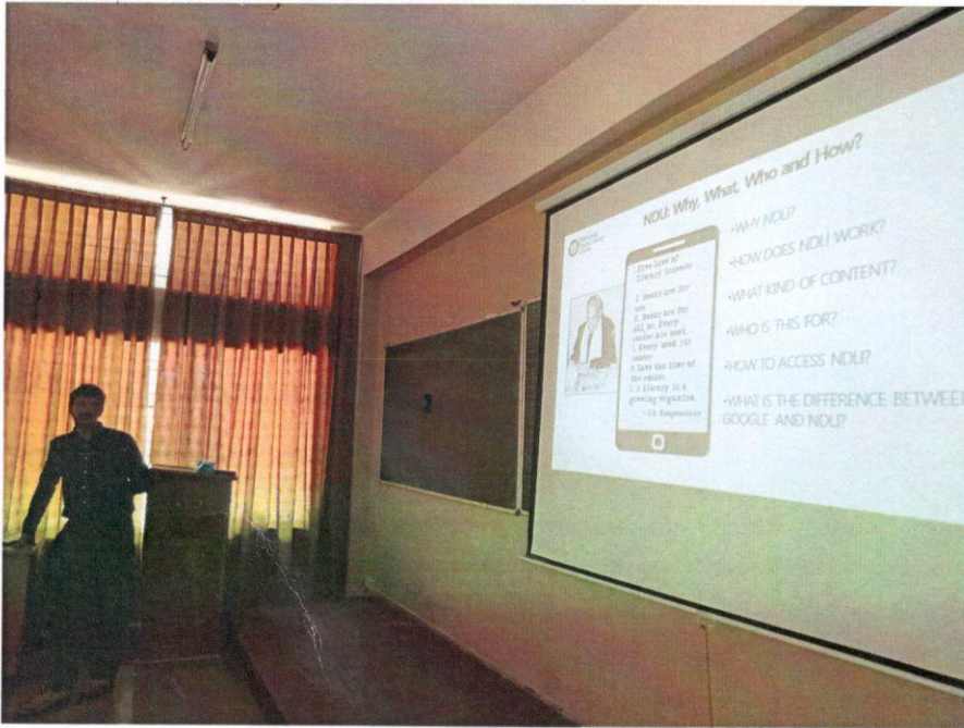
Librarian addressing the students